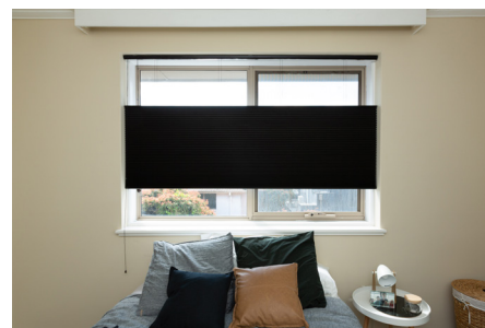
Top down & bottom up